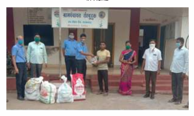
Grocery kits donated to Panchayat in Roha