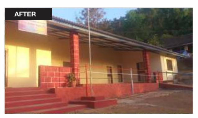
Building and maintenance of sanitation units, Ghaziabad, Uttar Pradesh