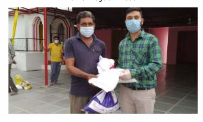
Essential ration items donated to the villagers in Baddi