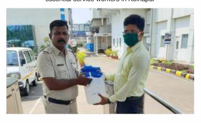
Masks and sanitizers provided to essential service workers in Kolhapur