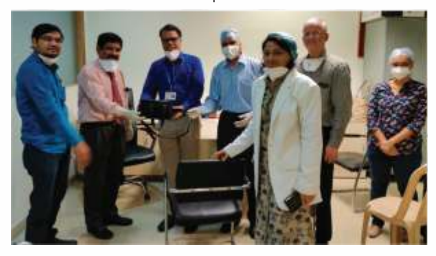
Essential medicines donated to COVID-19 hospitals in Mumbai