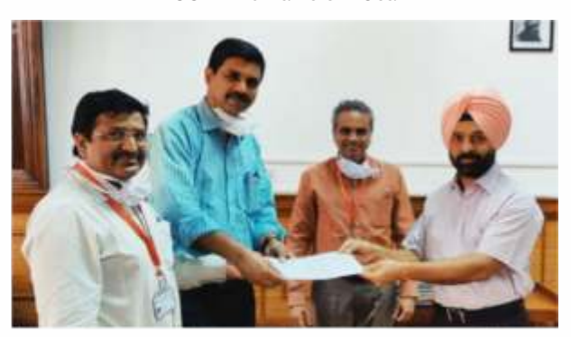
Essential utility items presented to COVID-19 warriors in Goa